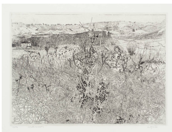
Artwork title: Winter Grasses