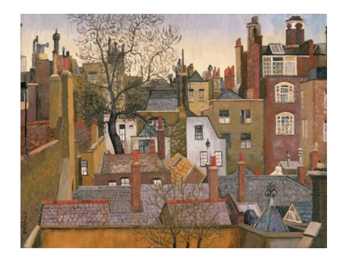
Artwork title: From a Window